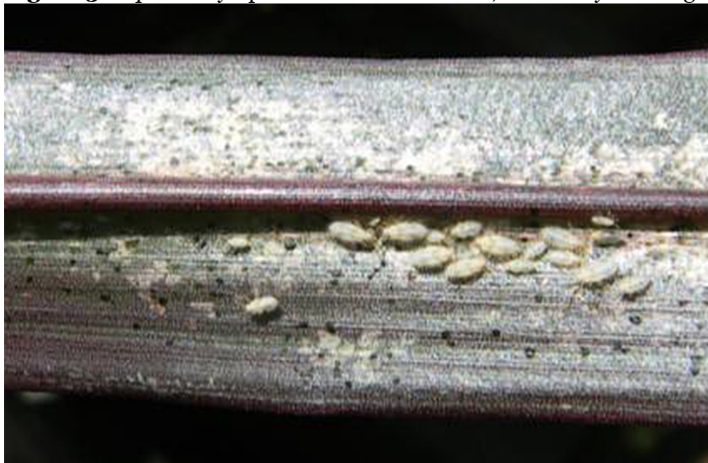
Figure 4. L. plana Adults and Nymphs on the Underside of a Leaf.