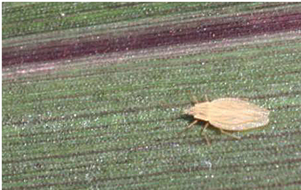
Figure 2. Adult Grass Lace Bug, L. plana .

Nymphs (Figure 3) are transparent when they hatch and turn cream to pale yellow-brown with spines as they grow. Newly hatched nymphs stay together in clusters, but they move more freely in later nymphal stages as they disperse to other leaves. Adults and nymphs in various stages of development are also often seen together on the undersides of the leaves (Figure 4).