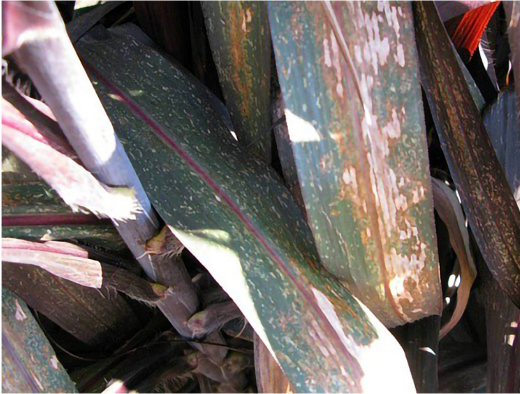
Figure 5. L. plana Damage. White stippling and leaf drying are evident on the upper surfaces of leaves in ornamental grass.