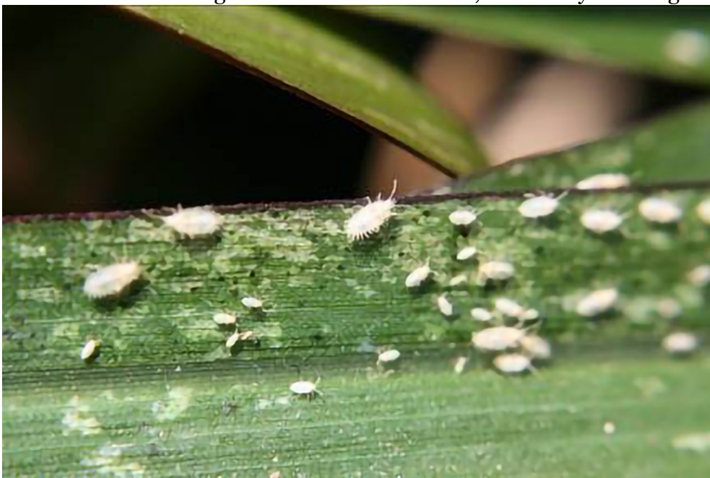
Figure 6. L. plana Nymphs and Frass Spots (Droppings) on a Lower Leaf Surface.