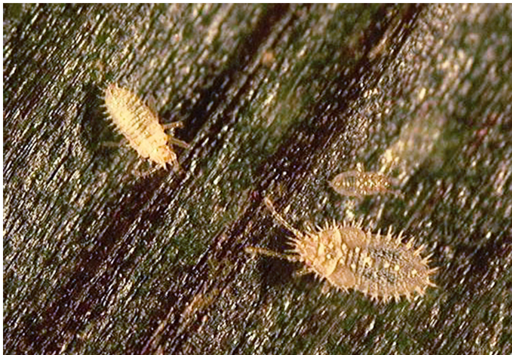
Figure 3. L. plana Nymphs.