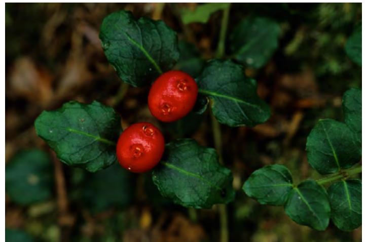
Partridge berry, Mitchella repens , has white flowers (left) that mature to red fruit (right).