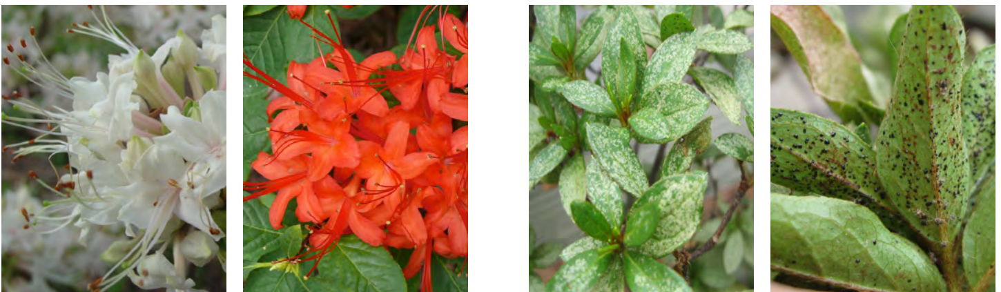
Piedmont azalea ( Rhododendron canescens ), left, and plumleaf azalea ( Rhododendron prunifolium ).

Non-native pests also use native plants for food. Some species of native azalea ( Rhododendron austrinum , for example) can be just as readily infested by the accidentally introduced azalea lace bug ( Stephanitis pyrioides ) as their exotic evergreen counterparts (Braman et al., 1992). Piedmont azalea ( Rhododendron canescens ) and plumleaf azalea ( Rhododendron prunifolium ) are two native azaleas that have demonstrated high levels of resistance to azalea lace bug. However, they have their own contingent of native insect plant pests (leafhoppers, caterpillars, true bugs, and beetles) that feed on their flowers, foliage, and stems (Braman & Beshear, 1994).