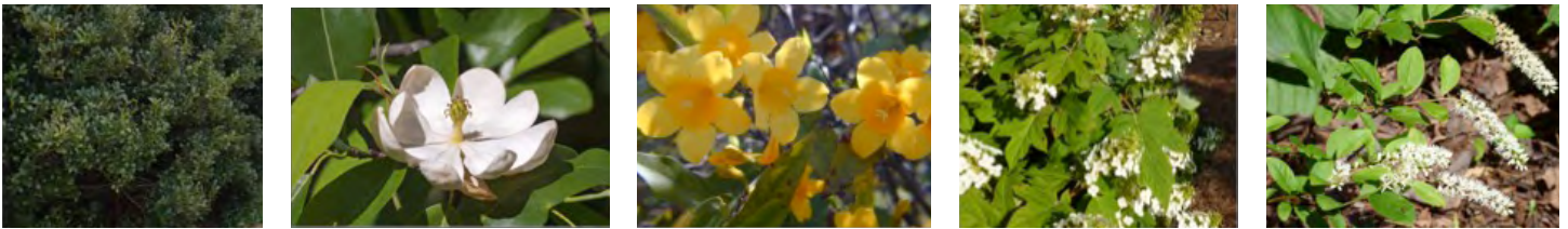
From left to right: inkberry, swamp magnolia, Carolina yellow jessamine, oakleaf hydrangea, Virginia sweetspire.

It is a common misconception that all native plants are drought tolerant. Some native plants require moist or swampy sites and will grow poorly on dry sites without supplemental irrigation during periods of limited rainfall. Examples include inkberry ( Ilex glabra ), Virginia sweetspire ( Itea virginica ), swamp magnolia ( Magnolia virginiana ), oakleaf hydrangea ( Hydrangea quercifolia ), and Carolina yellow jessamine ( Gelsemium sempervirens ).