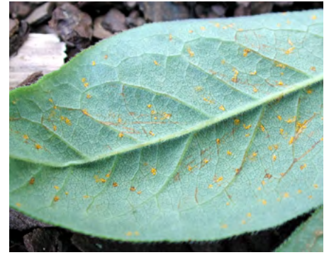
Leaf rust on native azalea.