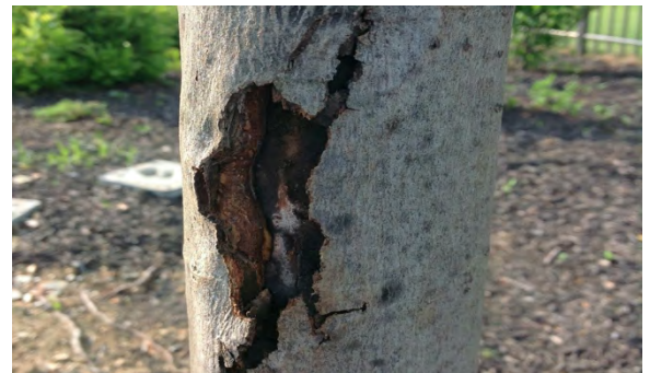
Figure 7. Winter injury following new growth (caused by defoliation during a late season hurricane) is not relegated to the tender new growth.

Often, fluids in the trunk flash-freeze, causing the vascular tissues to swell and burst as ice forms. The result is major damage to the trunk, which is not seen for six to 12 months after the injury occurs. In the case of this photo, the damage occurred in the fall following Hurricane Sandy and became apparent the following June.