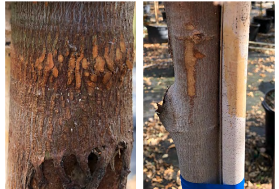
Figure 5. Incomplete (initial) trunk damage due to a strap/wire support system (top) and bamboo staking (bottom).

In both of these cases, there is no noticeable effect currently (two weeks after the event) but damage will likely become apparent in the following growing season.