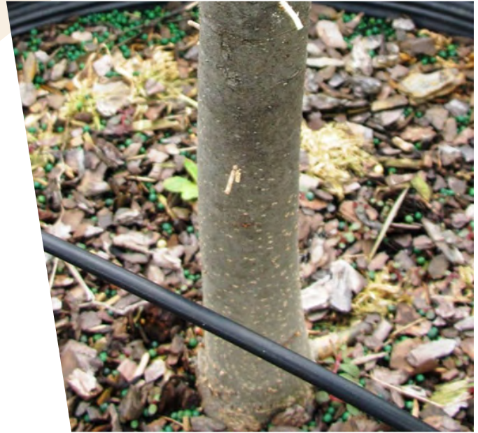
Figure 6. Secondary pathogen infection and insect infections due to root and stem damage.

In this case, a plant-volatile chemical (ethylene) is produced by the plant when it receives damage to stems and/or foliage. Granulate ambrosia beetle is attracted to ethylene and burrows into the stem of the tree, causing primary structural damage and transmitting vascular pathogens that cause disease and can ultimately cause plant mortality. This photo was taken in spring 2018 on nursery stock damaged by Hurricane Irma.