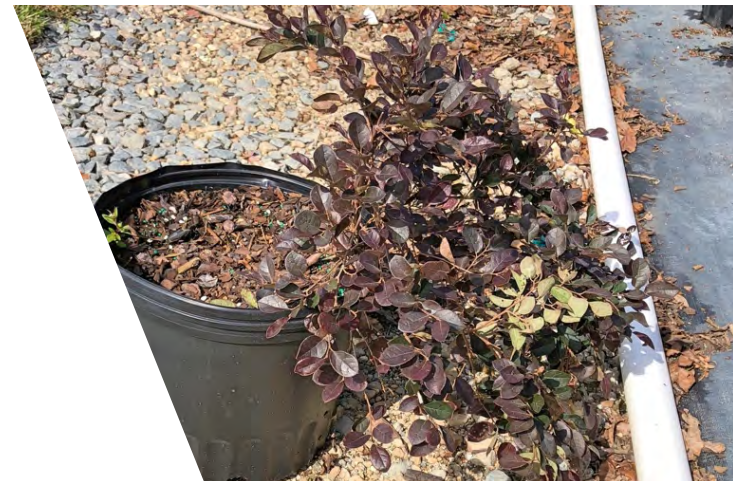
Figure 2. Misshapen loropetalum due to high winds from the left, causing the plant to lean considerably to the right.

Hurricanes and wind from strong storms can push tree and shrub canopies toward the leeward side. It is difficult to straighten tree trunks and canopies without causing notable root damage or breaking the trunk. Generally, the only remedy to misshapen plants (Figure 2) is to prune them considerably and allow regrowth. The extra time and labor expended on the plant typically results in crop being delayed to market and sold at a net loss.