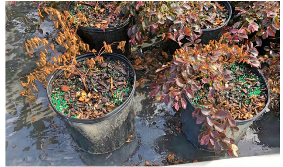
Figure 4. Crown damage at or below soil line.

The plant on the left has died due to the stem breaking below the soil line, whereas the plant on the right still appears healthy, although it is misshapen due to wind. With time, the plant on the right may also decline for the same reason.