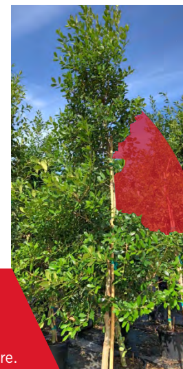
Figure 3. Stem breakage such as this secondary ilex stem (right) result in misshapen canopies (left) that require major pruning to rehabilitate.

The red highlighted area represents the void in the canopy that resulted from a secondary stem failure.