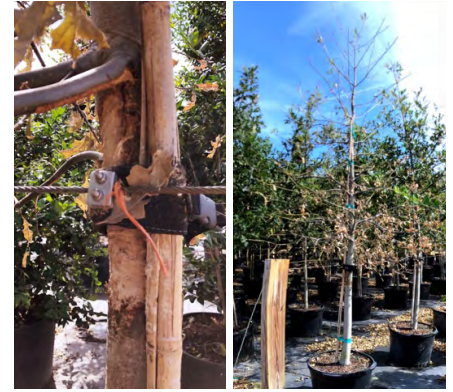
Left: Close up of bark and cambium damage resulting from support system movement. Right: Near complete defoliation and canopy death as a result of the damage.