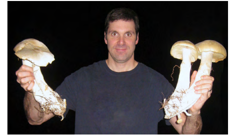
Fig. 3. Mushrooms from clusters of M. titans collected in Athens, Ga., in October 2012.