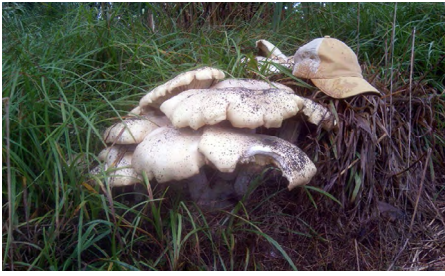
Fig. 1. Cluster of mature M. titans mushrooms in Athens, Ga., in October 2012. An adult-size baseball cap was placed in the background for scale.