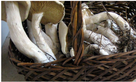
Fig. 4. Specimens of M. titans collected in Athens, Ga., in October 2012 showing wavy, cream to dull-yellow gills and scaly, striated stipes.