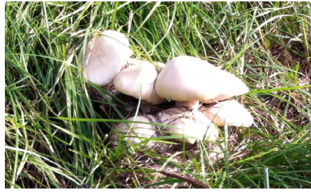
Fig. 2. Cluster of young M. titans mushrooms in Athens, Ga., in October 2012.