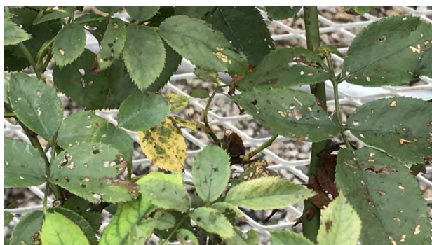
Figure 3. Feeding damage caused by the adult red-headed flea beetle on rose ( Rosa spp.) leaves. Feeding damage presents as holes in the leaves, which make the plants unmarketable.