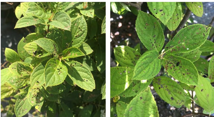
Figure 4. Feeding damage caused by the adult red-headed flea beetle on hydrangea ( Hydrangea spp.) leaves.

RHFB adults feed on leaves, causing numerous holes, and sometimes skeletonizing them by removing the surface layer of both upper and lower sides of mature leaves (Figures 3 and 4). They often deposit fecal matter near the feeding site (Figure 1). Damage to plants can be severe and rapid depending on the number of invading RHFB adults. Affected plants are typically not marketable. Although RHFB larvae feed on the roots, they rarely cause noticeable damage.