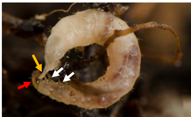
Figure 2. A larval red-headed flea beetle on weigela ( Weigela spp.) roots. The white arrows show three pairs of legs, the red arrow shows the head capsule, and the orange arrow shows the last segment on the larva's rear-end, which is oriented upward.