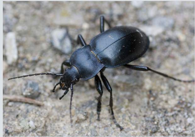
▲ Ground beetles (Carabidae) are voracious predators of other insects, thrive in wetlands, and studies show they readily move from the wetlands to upland fields to forage.