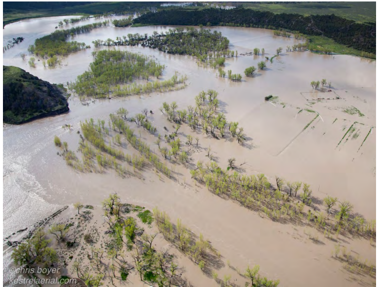
▲ Wetlands absorb excess water from large floods, reducing how high the water rises, and protecting people's property. Croplands on floodplains are enriched by the flooding, and those lands can become especially productive for crops after the floods subside.