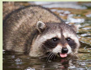
▲ Wetlands are hot spots for many game animals. Raccoons frequent wetlands to search for crayfish and other foods.