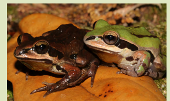
▲ Wetlands are homes for a diversity of small animals. Georgia is renowned for supporting an especially high number of frog and salamander species, almost all of which breed in wetlands. Pictured are ornate chorus frogs.