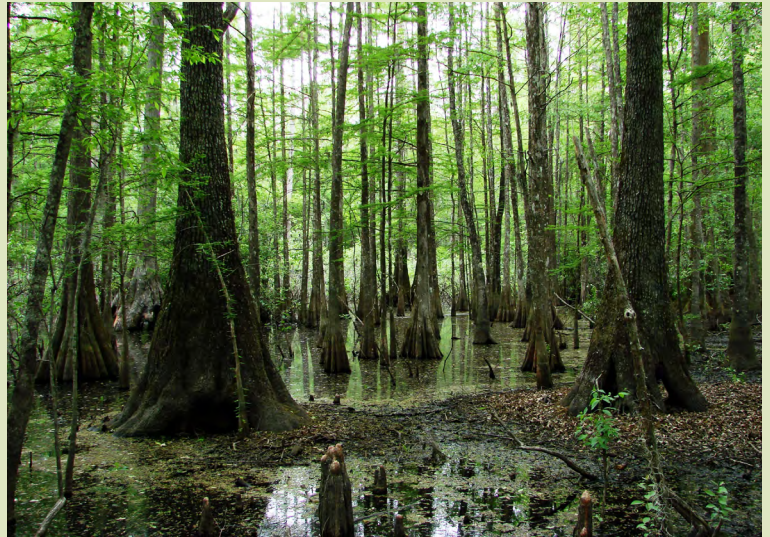
▲ Forested wetlands, commonly referred to as “swamps,” are especially common in the Southeastern U.S. and support wetland trees like cypress and tupelo.

The hydric soils in wetlands contain so much stagnant water that oxygen is eliminated (they are anoxic). As a result, the microbes (such as bacteria) that live in wetland soils have unique ways to survive; instead of using oxygen to respire, they use nitrate or other chemicals. Because farmers rely heavily on nitrogen fertilizers, the hydric soils of wetlands are an especially important feature of wetlands for agriculture. Hydric soils can be readily seen by simply digging a hole in a suspected wetland and looking for black or dark gray soil, indicating that oxygen is not present (orange or yellow soils have oxygen present).