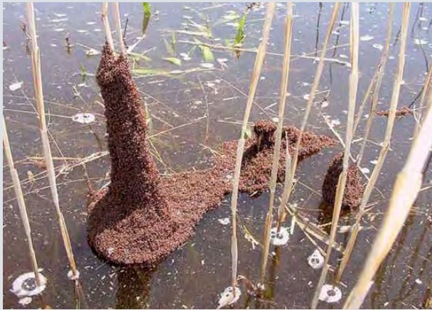
▲ Did you know that in their native South America, the imported fire ant lives in wetlands, and during floods colonies can float? Studies in Georgia indicate that these wetland ants are especially effective predators of pest insects in cotton and other crops.