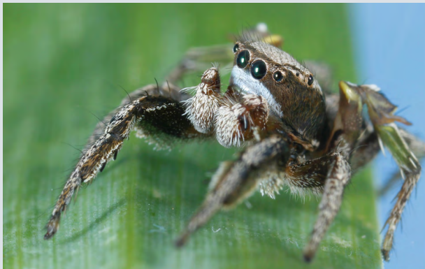
▲ Spiders thrive in wetlands, and many are highly mobile (like wolf spiders and this jumping spider) and move from the wetlands into adjacent crop lands to capture their insect prey.