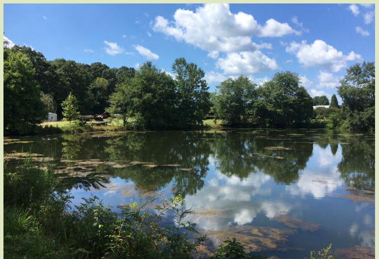
▲ Farm ponds created for watering livestock or supplying irrigation water can also support numerous wetland fish and insects and can supply drinking water for birds, wildlife, and honey bees.