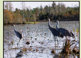
▲ A wide range of birds use wetlands as habitats, such as these Florida sandhill cranes in the Okefenokee Swamp. Photo: © 2012 by the Regents of the University of California. Published by the University of California Press