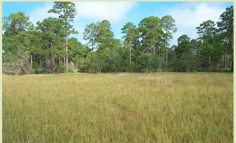
▲ Marshes, sometimes called “wet prairies” or “wet meadows,” support grassy wetland plants like these sedges.