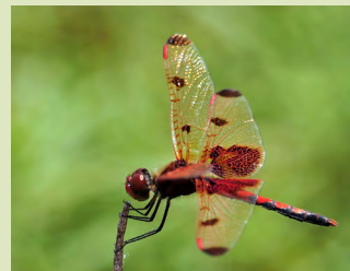
▲ Many aquatic insects, such as this dragonfly, develop in wetlands, and after they emerge, will fly into the surrounding areas, including croplands, in search of other insects to eat.