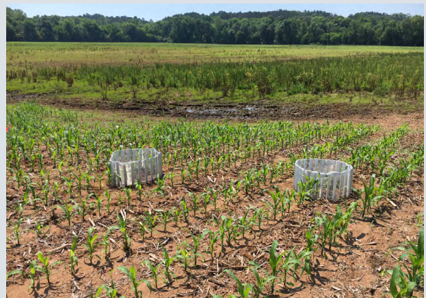
▲ Researchers at the University of Georgia Iron Horse Research Farm are conducting studies to identify which insect natural enemies move between a wetland (background) and an adjacent corn field, and are using experimental cages (circular structures) to determine how corn plants (and other crops) benefit from the pest control exerted by these wetland natural enemies.