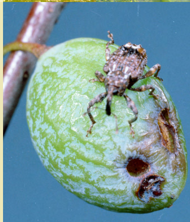
Plum curculio and fruit damage.

Control: Apply approved insecticides during petal fall. Additional insecticides should be applied if new damage appears.