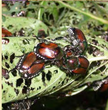
Japanese beetles in leaves.

Control: Removing damaged fruit from trees and from the ground can be very helpful in controlling these insects. Monitor for beetles and treat as needed with approved insecticides.