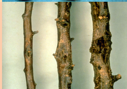
Bacterial canker in plum.

Control: Remove infected limbs and scaffolds. Never leave pruned wood under the trees. Plant resistant varieties, and keep in mind that California varieties are known to be highly susceptible.