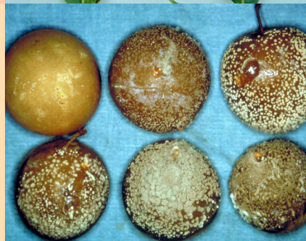
Brown rot in plum.

Control: Remove infected fruit or limbs and provide proper drainage. In Georgia, it is very difficult to control brown rot without fungicides. Apply approved fungicides.