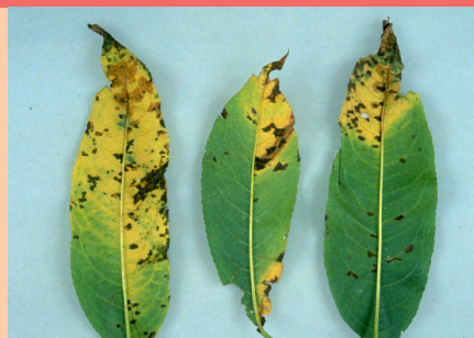
Bacterial spot in peach leaves. Similar symptoms in plum leaves.

Control: The best prevention to bacterial leaf spot is to plant varieties that are resistant to the disease. Copper-based fungicides can be used for control of this pathogen.