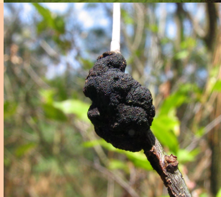
Black knot in plum. Similar symptoms in plum leaves.

Control: Remove infected limbs and scaffolds. Never leave pruned wood under the tree. Most varieties are susceptible to this disease.