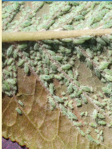
Aphids in plum leaf.

Control: Aphids can be treated using natural predators like green lacewings or lady beetles. During the dormant season, they can be treated with horticultural oil, neem oil, or insecticidal soap. Coverage on the backsides of leaves is critical.