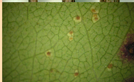
Rust lesions on plum leaf.

Control: To treat rust, use a fungicidal regimen just prior to the fruit trees' bloom. The appropriate fungicides are the same used for brown rot.